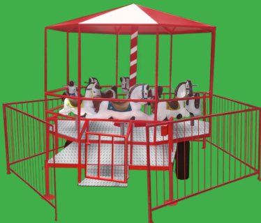
AMUSEMENT PARK CAROUSEL