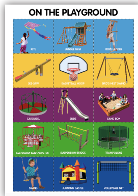
An A4 page with 15 word pictures themed "On the Playground"