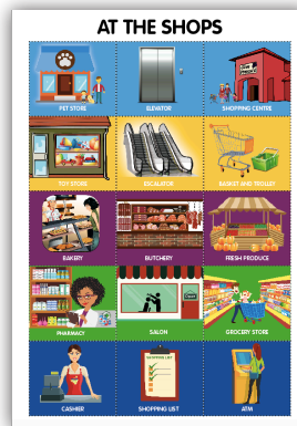
An A4 page with 15 word pictures themed "At the Shops"