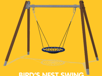
BIRD'S NEST SWING