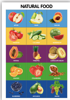
An A4 page with 15 word pictures themed "Natural Food"

The tool consists of the following printable pages: